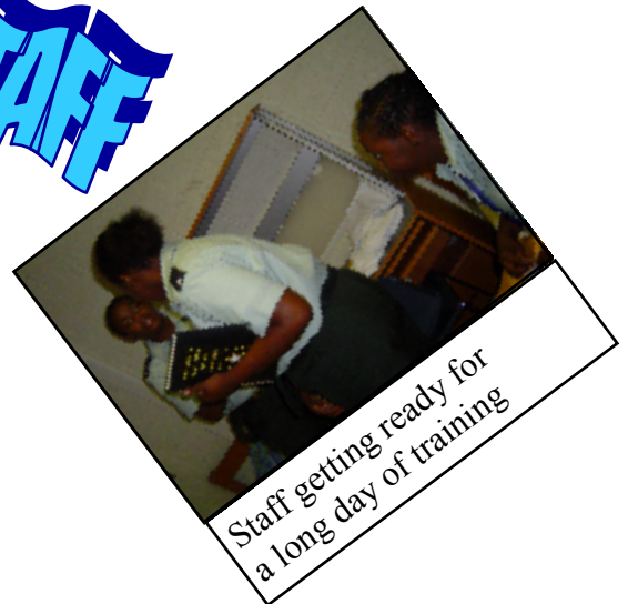
Staff getting ready for a long day of training