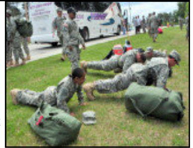
PUSH UP ON THE 1ST DAY? ITS GOOD TO START EARLY

These summers has been the best summers ever. Every year I have had a wonderful time. My first year I didn't know what to except, it sounded scary but I was made a leader. The last day I was sad because I had to leave all the people I grew a friendship with. Overall I had a wonderful time every year. I was proud when I received the top female award for my company. I encourage every cadet to go, and if I could I would attend again trust me I would.