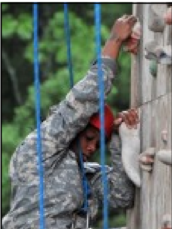
CADET ON ROCKWALL

BEFORE. WHEN I FIRST GOT THERE I WANTED TO GO HOME BECAUSE I WAS NOT USE TO PEOPLE BEING ALL UP IN MY FACE, WAKIENG UP AT 4:50 IN THE MORINING, RUSHING TO EAT BREAKFEST, LUNCH, AND DINNER. WHAT WAS FUN ABOUT IT WE DID THINGS LIKE ROCK CLIMBING, RIVER RAFTING, MARKSMAN, LAND NAVAGATION AND MANY OTHER THINGS. I MADE A LOT OF FRIENDS THERE I MEET FRIENDS FROM DIFFERENT SCHOOLS ALL OVER MICHIGAN. I WAS IN THE BEST COMPANY EVER IN THAT WAS CHARLIE COMPANY. BUT OUT OF ALL OF THIS I EARNED MY WAY THREW THERE IN I